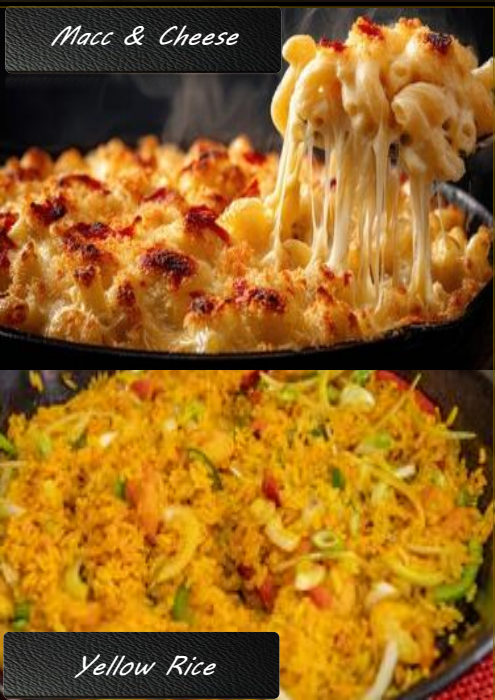
Macc & Cheese

Roasted butternut squash, tomato, spinach, walnuts, wild rice stuffing, fontina $10.25