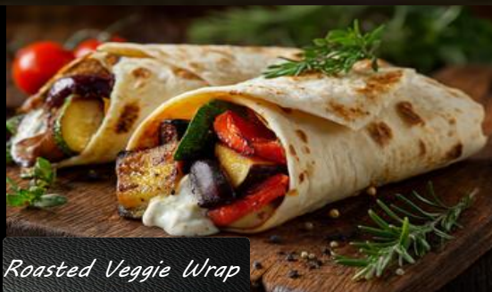
Roasted Veggie Wrap