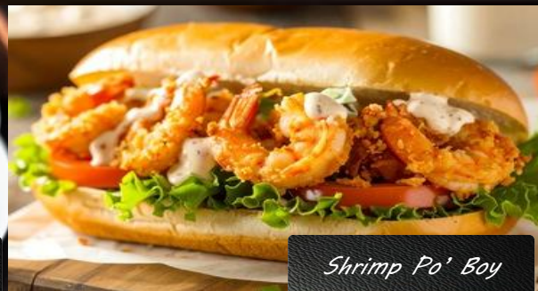
Shrimp Po' Boy